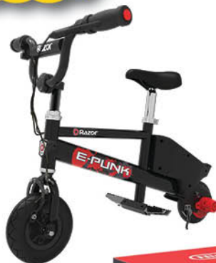
RAZOR E-PUNK ELECTRIC MICRO BIKE