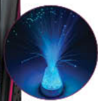
FIBRE OPTIC LAMP