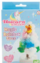
MAGIC RAINBOW TREE