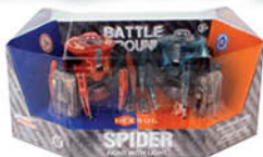
HEXBUG BATTLE GROUND SPIDER