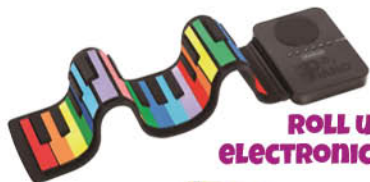
ROLL UP ELECTRONIC PIANO