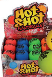
HOT SHOT HANDBALL