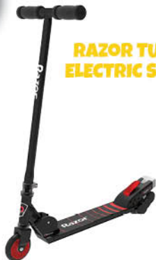
RAZOR TURBO-A ELECTRIC SCOOTER