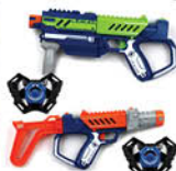
BATTLE OPS LASER TAG