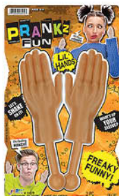
PRANKZ LIL' HANDS