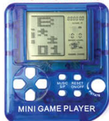
MINIATURE RETRO ARCADE GAME