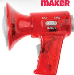
mini voice CHANGER