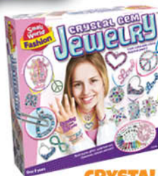
CRYSTAL GEM JEWELRY