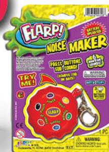
FLARP NOISE MAKER