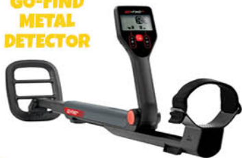
GO-FIND METAL DETECTOR