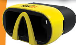
VIRTUAL REALITY GLASSES